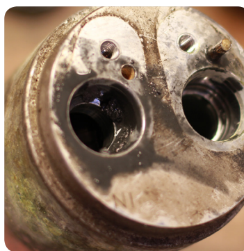
Contamination of the in- and outlets will cause the receiver dryer to clog

Too much oil in the system – If the recommended lubricant volume is exceeded, it reduces the dryer ability to filter the system properly as the desiccant and filter layers will overflow. Too much UV agent or flushing agent residues in the system will have the same effect on the receiver dryer.