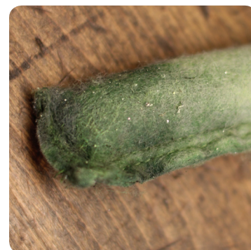
Worn out insert bag dryer - desiccant soaking by too much UV agent added to the system

©Nissens A/S, Ormhøjgårdvej 9, 8700 Horsens, Denmark. For further technical and contact information visit our website www.nissens.com .