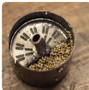
Desiccant layer inside the receiver dryer is overflowing